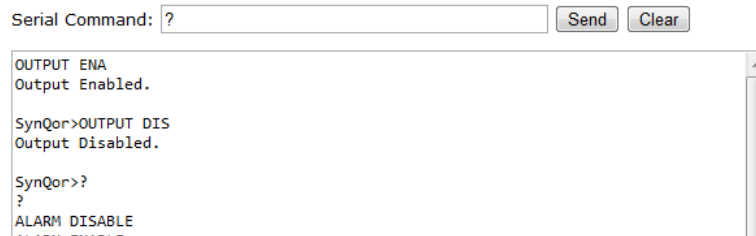
Figure J debug.htm Serial Interface Mirror

Note that the debug.htm form should only be accessed from a single browser at a time. If two browsers simultaneously view the page, the output pane will not display accurately.